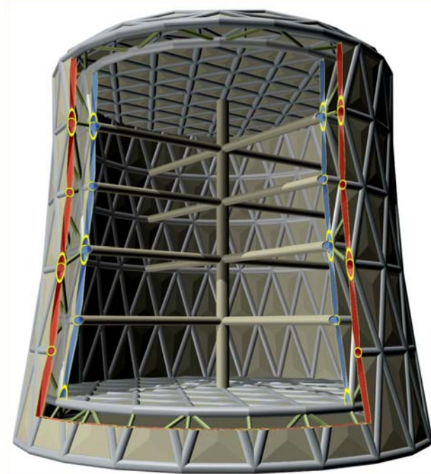
Figure 2 – Cutaway view of the proposed cryostat design. The inner cross-structure is indicated for an eventual increase of the inner vessel rigidity.