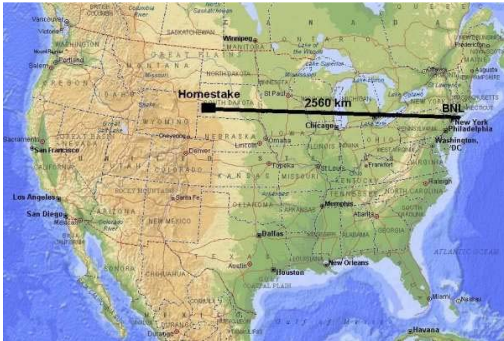
Figure 4 – DUSEL Homestake site.